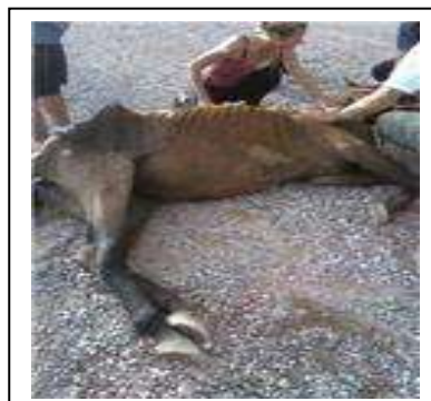
The mare when she collapsed.

Donations are currently needed to help defray the cost of her surgery. Please help us help her. You can make your donation via our website using PayPal and the "DONATION" button and just send a note that it is for Precious and her surgery. Your donation can also be mailed to us at PO Box 884, Sierra Vista, AZ 85635.