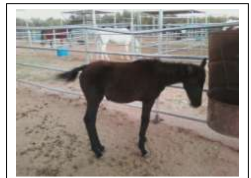
Little Precious, learning to be a big girl and alone without her mom.